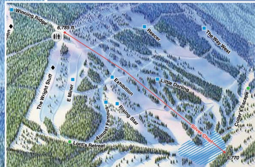
Silver Chief Lift (conditions permitting) Saturday and Sunday 12:00 - 3:30